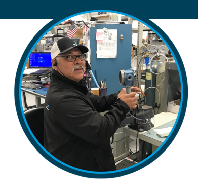
INSTRUMENT & ANALYTICAL