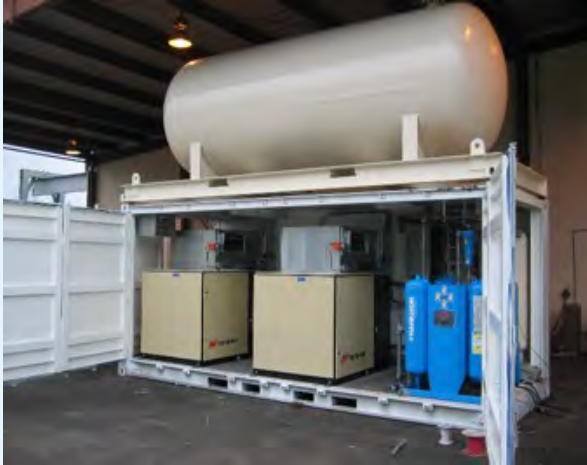
Mobile ISO Container System