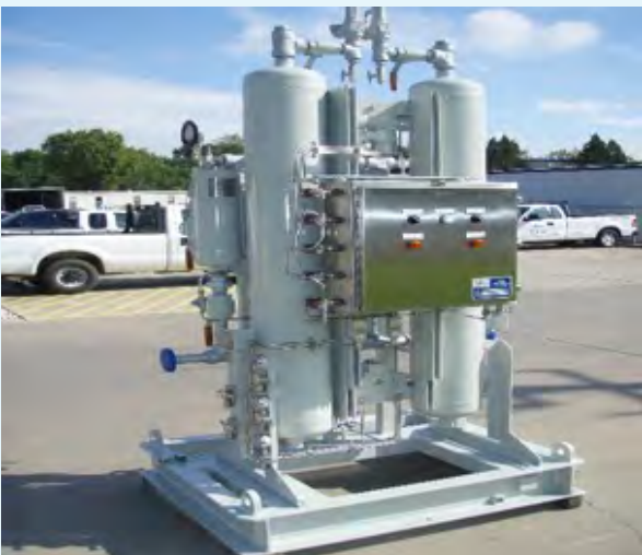
Air Dryer & Filtration Systems

Relevant Industrial's team of engineers are uniquely capable to satisfy our client's needs by providing innovative engineering expertise as well as system integration capabilities. Our Engineers work with Relevant's reputable manufacturing partners, such as Ingersoll Rand, Honeywell, Parker, Baker Hughes, Sahara Henderson, SPX Flow and MD-Kinney, as well as their own industry network to design, engineer, specify, and execute your project needs.