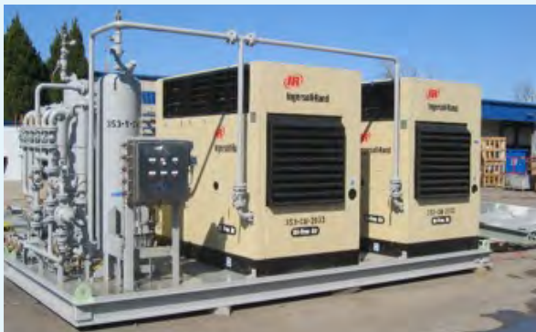
Standard Skid Frame Mount System