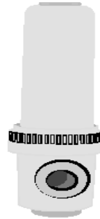
In Line Flow Style