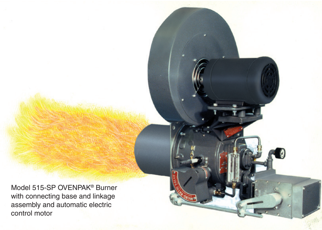
Model 515-SP OVENPAK® Burner with connecting base and linkage assembly and automatic electric control motor