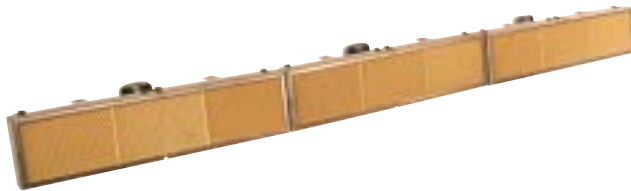
Front view – Type 13 assembly

RadMax™ Burners can economically increase production rates, reduce seconds and defects caused by improper or uneven heating or drying, and reduce down time and maintenance costs when the need for service or repair arises.