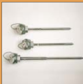
RUBBER COMPOUND MIXER SENSORS Thermocouples with Chrome Coated Tips for Abrasive Service