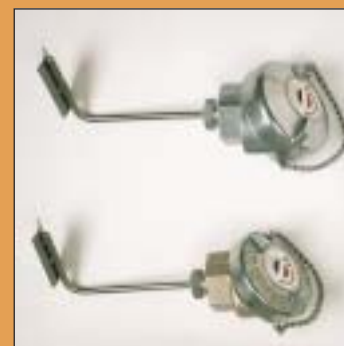
HEAT TRACING SENSORS RTDs or Thermocouples with radius pads for pipeline temperature measurements.