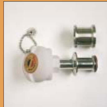
TRI-CLAMP TANK SENSOR RTD's or Thermocouples to measure tank temperatures with a sanitary tri-clamp connection.