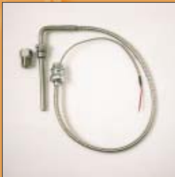
ENGINE THERMOCOUPLES Thermocouples to measure cylinder head exhaust temperatures.