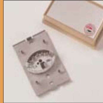
THERMOSTAT TEMPERATURE SENSOR RTD's or Thermocouples for room temperature measurements.