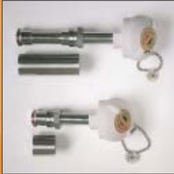
NON-INTRUSIVE TANK SENSORS RTD'S or Thermocouples to measure temperatures inside single wall or jacketed mixing tanks.

Pyromation's expertise in engineering design, skilled machining capabilities, and manufacturing abilities allow us to offer our customers custom designed temperature sensors to solve those difficult temperature measurement problems found in many industrial process applications. Many of the products depicted are specific process standards, and others are customer driven special designs. Our engineering, sales and production departments are at our customers' disposal to provide them with solutions to their unique temperature measurement problems.