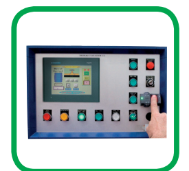
Mounting in enclosure