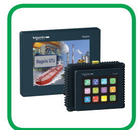
5.7" or 3.5" screens