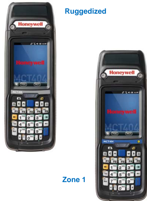
Figure 1 MCT404 Selectable versions (Ruggedized and Zone 1 Intrinsically safe)