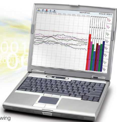
Remote viewing and control via Web browser.