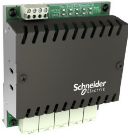
Figure 1: 5910 Ethernet Gateway Module

Applications include in-plant I/O and connectivity between SCADAPack controllers and operator workstations, other PLC devices and SCADA systems communications that uses 10BaseT (10 Mbps) or 100BaseT (100 Mbps) in an industrial environment.